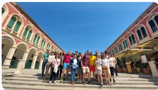
TEACHING SESSIONS – Hosting Lectures for Erasmus+ teachers